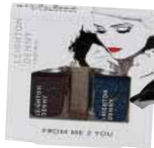
Lovely lacquer: Leighton Denny Expert Nails From Me 2 You Polish With Love Collection, €25, Marks and Spencers