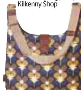
Pretty in print: Orla Kiely Forest Flower Midi Sling Blueberry bag, €169, Kilkenny Shop