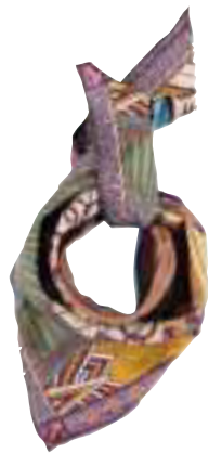
Pop of print: Passigatti Abstract Print Scarf — Gold, €60, Arnotts