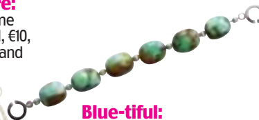
Blue-tiful: Chunky Tibetan Turquoise And Sterling Silver Bracelet, €125, juvidesigns.com