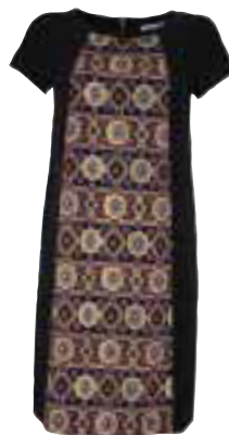
High style: Marella Print Cipro Dress, €235, Arnotts