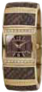
Time for a change: M&S Collection Diamante Faux Reptile Skin Print Bracelet Watch, €47, Marks and Spencer