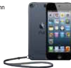
Jingle bells: Apple iPod Touch, 32gb, €329, Arnotts