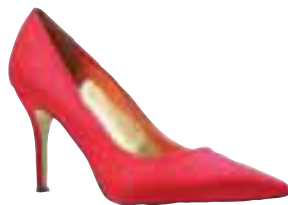
Red hot: Nine West Flax22 red heels, €120, ninewest.co.uk