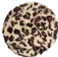
Bonjour, madame: Savida leopard print beret, €15, Dunnes Stores