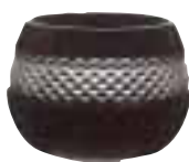
Subtle: Waterford John Rocha Black Cut Votive candle holder, €90, Arnotts