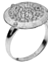
Bit of sparkle: DKNY Silver Diamante Disc Ring, €54, Debenhams