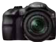
Snap happy: Sony Alpha A3000 SLR, 20.1MP, €340, Argos