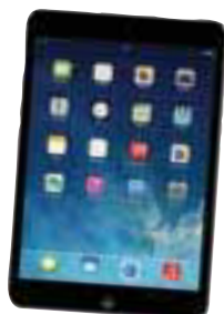
On the go: Apple iPad Mini Wi-Fi 16GB, €299.99, Argos