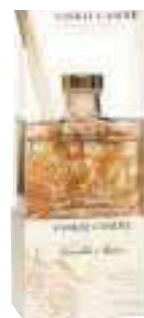
Vanilla sky: Yankee Candle Reed Diffuser Vanilla Satin Signature Ra, €13, Littlewoods Ireland