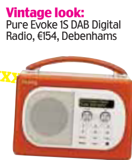
Vintage look: Pure Evoke 1S DAB Digital Radio, €154, Debenhams