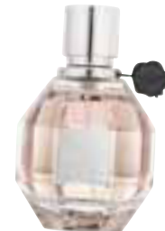
Perfect perfume: Viktor and Rolf, 50ml Flowerbomb, €124, Littlewoods Ireland