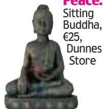
Peace: Sitting Buddha, €25, Dunnes Store