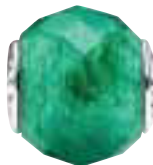
You're a gem: Pandora Essence Collection Prosperity Charm, €49, Arnotts