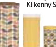
Tea for three: Orla Kiely Canister Set Of Three, €28.95, Kilkenny Shop

TOMORROW GIFT IDEAS TO PUT UNDER THE TREE FOR YOUR FATHER