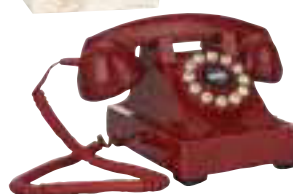
Ding a ling: Wild & Wolf 1930's 'Series 302' Phone, €54, Debenhams