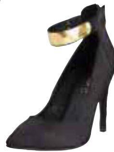
Look sharp: Definitas Falana Court Shoes, €31, Littlewoods Ireland