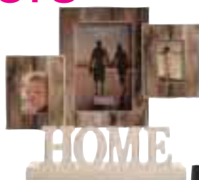
Picture perfect: Home Collection Multi Photo Frame, €16, Littlewoods Ireland