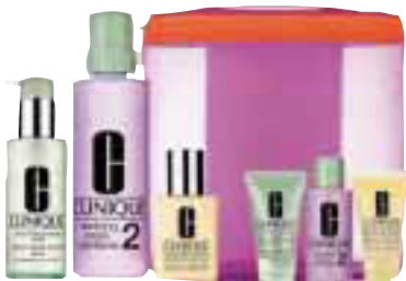
Soft skin: Clinique Great Skin Home & Away (Skin Types 3&4) €99, Brown Thomas