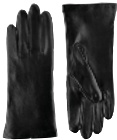
Touch of class: Autograph cashmere-lined leather gloves, €47.50, Marks and Spencer