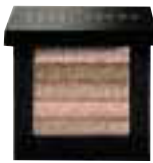
Time to shimmer: Bobbi Brown Shimmer Brick Compact – Bronze, €42.50, Brown Thomas