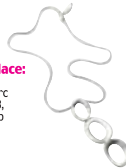
Neat necklace: John Rocha Three Oval Circ Pendant, €153, Kilkenny Shop