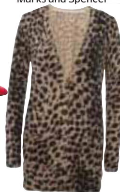
Be spotted: M&S Collection Pure Cashmere Animal Print Cardigan, €160, Marks and Spencer