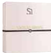
Heavenly scents: Armani Si For Women Gift Set, 30ml, €49.50, Arnotts