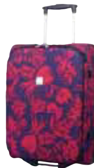
Easy to use: Tripp Express Autumn Flower Suitcase, €169, Debenhams