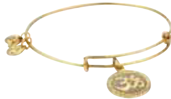
Wristy business: Alex And Ani Om Bracelet, €30, Arnotts