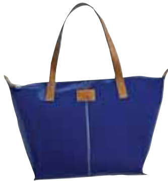
Blue maiden: Paul Costelloe Living Patent Bag, €35, Dunnes Stores