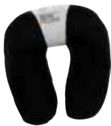
A little help: Travel Neck Pillow, €22, Littlewoods Ireland